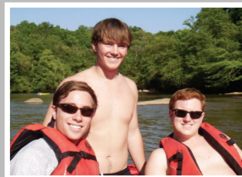
Broad River Rafting Trip in Athens, GA