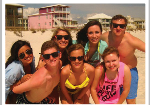
Snake Break in Gulf Shores, AL