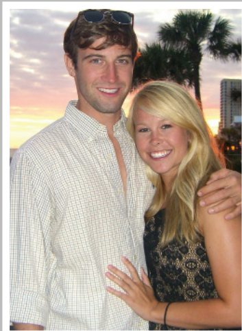
White Star Beach Weekend in PCB, FL