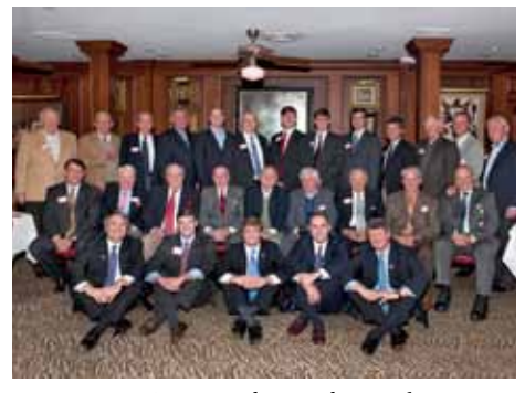
Former Commanders and special guests gathered in Atlanta for Mu Chapter's annual Commanders' Dinner.

Next year's dinner will be held on January 10, 2013, at Bone's Restaurant in Atlanta.