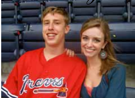
On April 17, 2012, three charter busses left River Road en route to Turner Field in Atlanta. Brothers and their dates enjoyed a great evening watching the Atlanta Braves defeat the New York Mets 9-3.