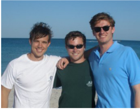
Snake Break in Gulf Shores, AL