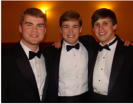
White Rose Formal in Dillard, GA