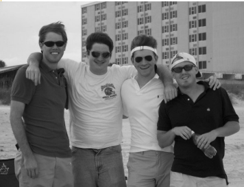
Brothers at the beach for semi-formal.