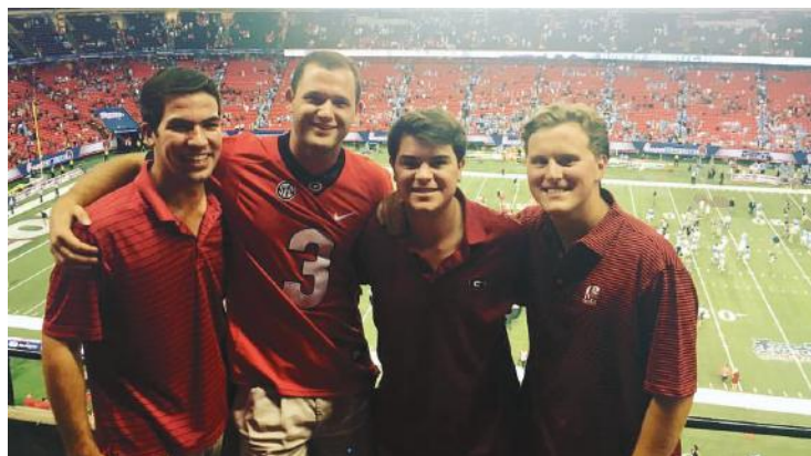
Brothers of Mu Chapter enjoying the UGA vs. UNC game in Atlanta.