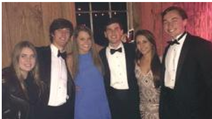
Brothers of Mu Chapter with their dates at Formal Weekend..