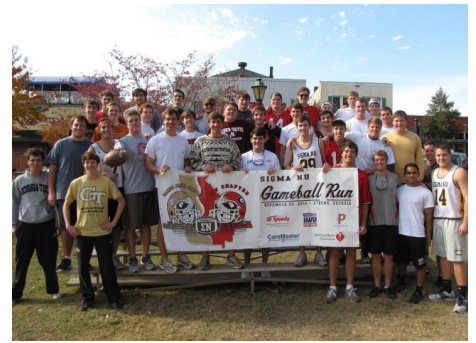
The Mu and Gamma Alpha Chapters meet at the half-way point in Lawrenceville, Georgia.