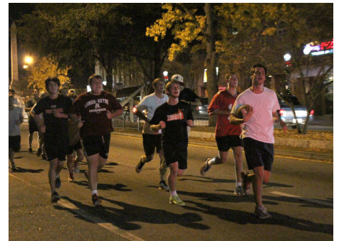
Runners from Mu Chapter sprint through downtown Athens toward Sanford Stadium.