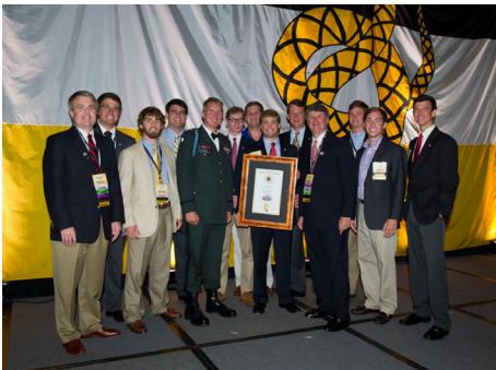
Collegiate and alumni members of Mu Chapter stand with their second consecutive Rock Chapter Award.