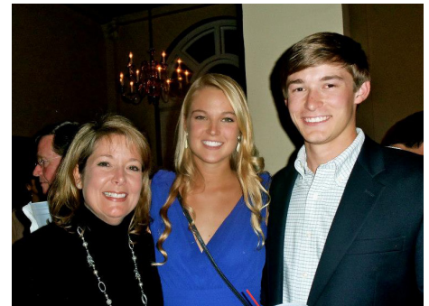
Mu Chapter hosted its annual Parents Weekend on November 2 - 3 before the Ole Miss game. Families enjoyed live music and dancing at the Georgian Hotel in downtown Athens before a catered tailgate on Saturday sponsored by the White Rose Society.