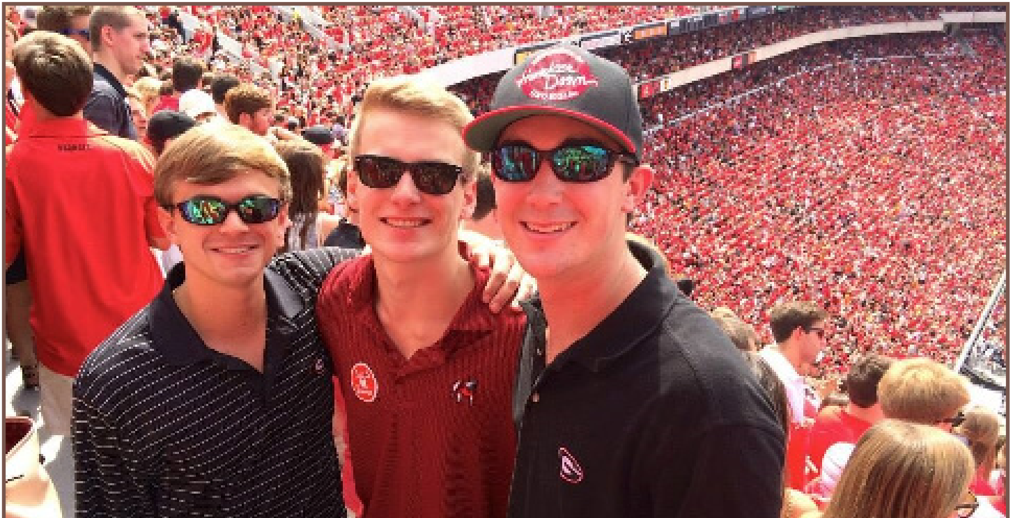
Game Day in Athens!