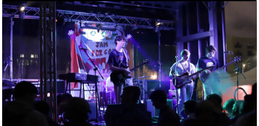
Himalayan Pool Party performing at Jam for Cam