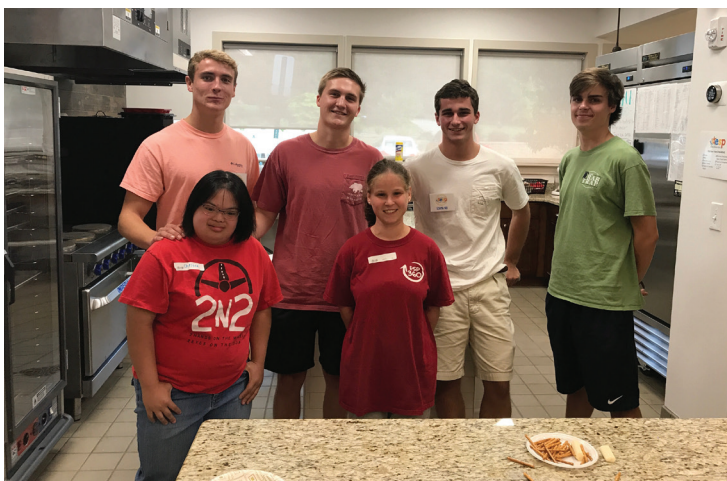
Sigma Nu brothers handing out snacks for ESP